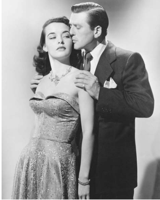
Roadblock (1951). Directed by Harold Daniels. Shown: Charles McGraw (as Joe Peters), Joan Dixon (as Diane Marley).

tempted by an alluring combination of sex and riches. The story's chief irony is that Diane could have been gained by Joe without any need for criminality. While early dialogue describes her as a "chiseller," and while even Joe distrusts her sincerity, she later finds a conscience and changes from her mercenary ways. After making repeated claims that he is too underpaid to afford someone like her, Diane visits Joe's flat and says that money does not matter; but it is too late for her honesty to have a good effect as he is already inextricably involved in planning the hijacking. He cannot pull out, even though she declares herself to be crazy about him. In contrast to her character shift toward morality (perhaps a result of Production Code Administration influences on the script), he changes the other way, from "Honest Joe" to someone who betrays his employer and eventually even commits murder.