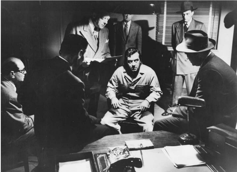
Kansas City Confidential (1952). Directed by Phil Karlson. Shown: John Payne (as Joe Rolfe).

the identity of the men. The plan also depends on exact timing as the armored car arrives at an inner city bank at the same time each morning as a nearby florist van. The robbers utilize a similar van so as to divert police attention onto the innocent florist driver. The robbery is successful, and the police detain Joe Rolfe, the driver of the florist van, for questioning. Karlson exploits this setup fully as he shows in detail the arbitrary, brutal methods employed by the police to extract a confession from Rolfe, an ex-convict. However, when the getaway van is found, Assistant District Attorney Martin reluctantly releases Rolfe. Rolfe, angered by his treatment by the police and the criminals, goes after them. Following a tip from an underworld figure, he finds Harris in Tijuana, and he employs the same brutal methods used by the police to force a confession from Harris. When Harris is killed by the local police, Rolfe assumes his identity and travels to a small Mexican resort where the other participants are waiting. A cat-and-mouse situation follows as the criminals try to get their share of the robbery, and only the intervention of Foster's daughter Helen, a law student who is vacationing with her father, saves Rolfe's life when his true identity is revealed. The film climaxes on a boat anchored in the bay, and following a shoot-out, Kane, Romano, and Foster die. Rolfe, to protect Helen, decides not to expose Foster's involvement in the crime.