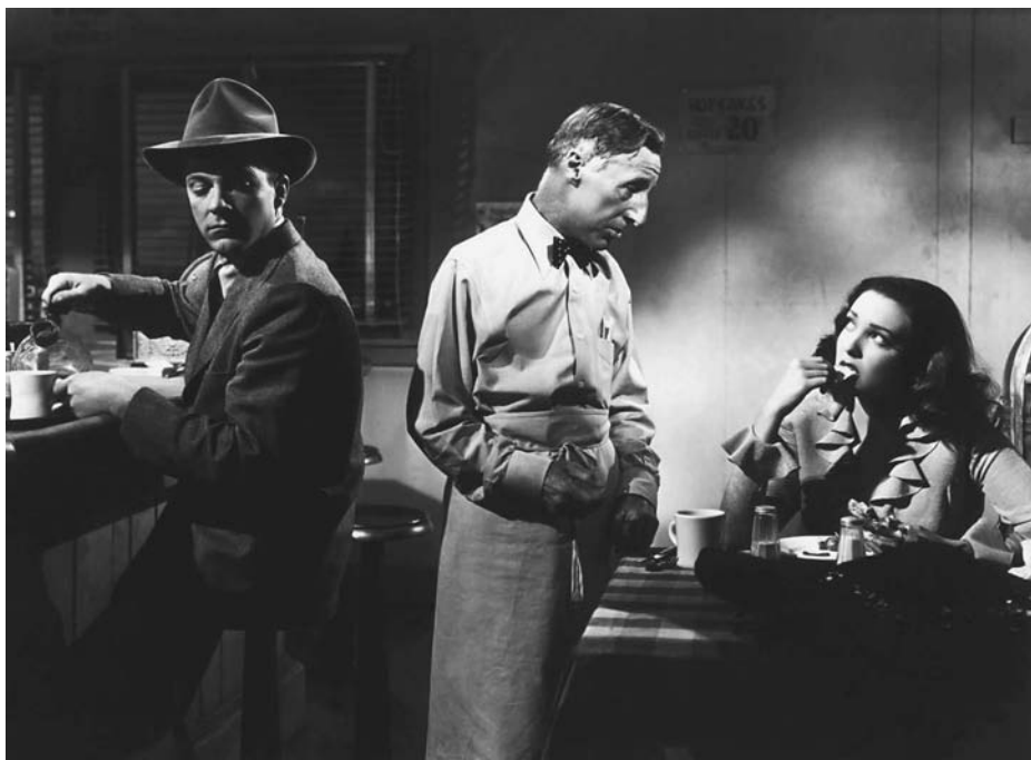
Fallen Angel (1945). Directed by Otto Preminger. Shown from left: Dana Andrews (as Eric Stanton), Percy Kilbride (as Pop), and Linda Darnell (as Stella).

Darnell, who shows off a sexy pair of legs as she rubs a sore ankle. By chance, Eric also meets a couple of other grifters who are in town running a scam involving a fraudulent spiritualism act. By teaming up with this pair of likeable scoundrels, he comes into contact with June, a somewhat wealthy spinster who lives with a sister, also unmarried. Their substantial and decorous brightly lit home represents ideologically the polar opposite of the shadowy, raffish diner, which is redolent of obsessive desires. Eric soon wants to both satisfy his sexual needs with Stella and work on convincing June to marry him so that he can get at her substantial bank account. His scheming is put in jeopardy when the film's main object of desire, Stella, is brutally murdered, and Eric, along with other men who have romanced her, becomes a suspect. In good noir tradition he must become a quasi-detective himself to clear his name.