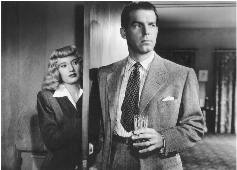
Double Indemnity (1944). Directed by Billy Wilder. Shown from left: Barbara Stanwyck (as Phyllis Dietrichson) and Fred MacMurray (as Walter Neff).