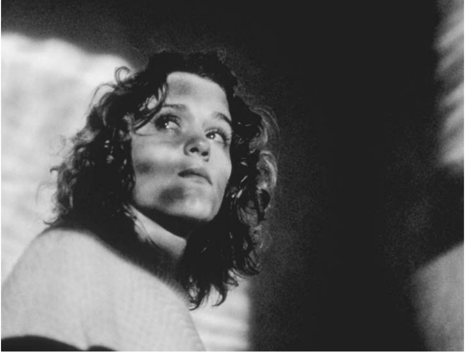
Blood Simple (1984). Directed by Joel Coen. Shown: Frances McDormand (as Abby).

Dan Hedaya (Julian Marty), M. Emmet Walsh (Loren Visser), Samm-Art Williams (Meurice).