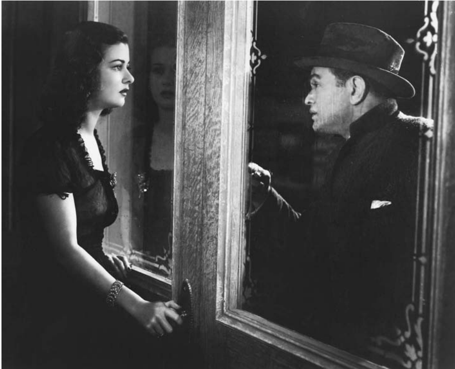
The Woman in the Window (1944). Directed by Fritz Lang. Shown from left: Joan Bennett (as Alice Reed), Edward G. Robinson (as Richard Wanley).

normal man who, through different circumstances, is forced to kill. Also, each film refused to abide by the classical Hollywood convention that normally requires films to resolve their plots with a clear-cut and logical ending.