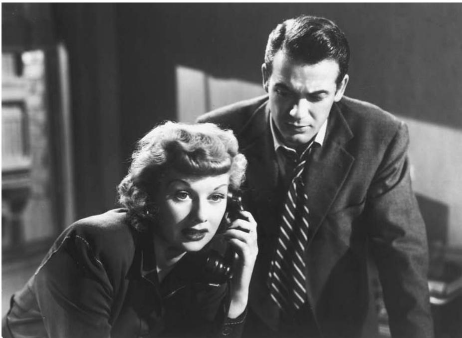
The Dark Corner (1946). Directed by Henry Hathaway. Shown from left: Lucille Ball (as Kathleen), Mark Stevens (as Bradford Galt).

Many film noir protagonists feel that the world is out to get them, or at least that some of the world's nastier inhabitants bear them malice. There are literally scores of such films that show an innocent man trapped by the vicissitudes of fate. The Dark Corner is one of the most famous of these films and one where the pressures on the main character are unrelenting until the very end. As Alain Silver and Elizabeth Ward phrase it in their book Film Noir: An Encyclopedic Reference to the American Style , this film is a "prototypical reflection of postwar malaise in film noir" (p. 82). Under the expert direction of Henry Hathaway, the audience is drawn in to the plot's morass of complex motivations and malicious conspiracies so that they come to share the near-despair of hero Bradford Galt. Galt is a tough detective caught up in a truly existential bind from which he keeps fighting to disentangle himself, aided by no one except his resourceful secretary Kathleen.