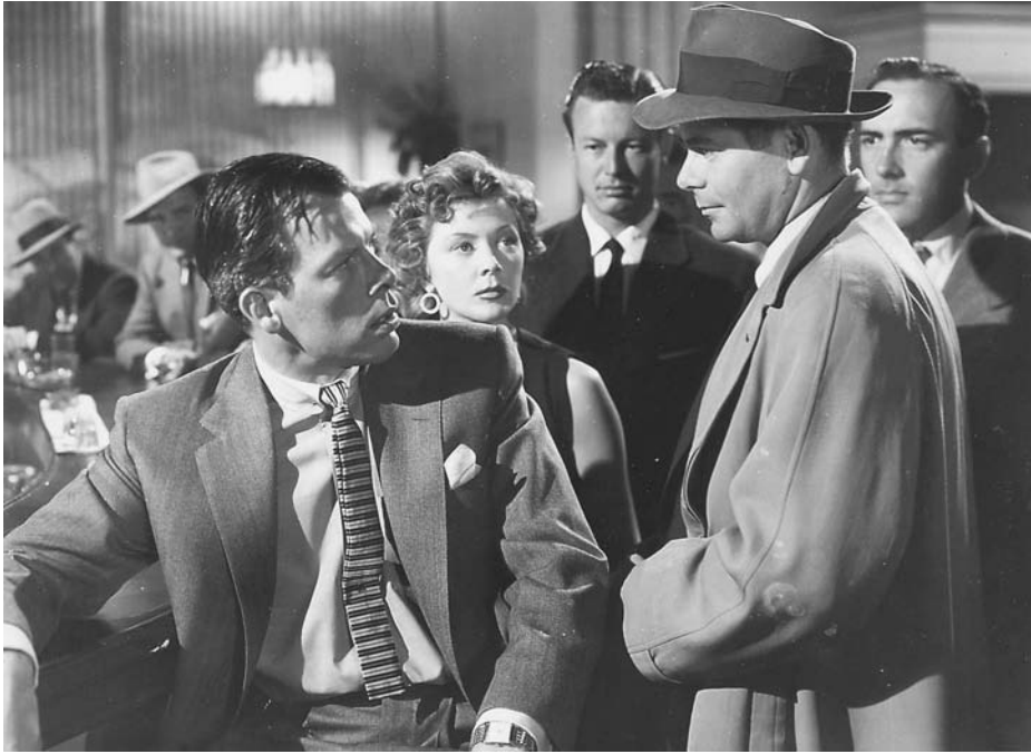
The Big Heat (1953). Directed by Fritz Lang. Shown in foreground from left: Lee Marvin (as Vince Stone), Glenn Ford (as Det. Sgt. Dave Bannion). Background center: Gloria Grahame (as Debby Marsh).