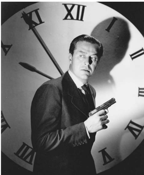
The Big Clock (1948). Directed by John Farrow. Shown: Ray Milland (as George Stroud).

Stroud's boss at Crimeways Magazine . Janoth kills Delos, although he does not know the identity of the man she is sleeping with. Janoth then assigns Stroud to find this man.