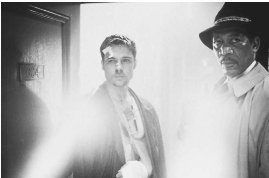
Se7en (1995). Directed by David Fincher. Shown: Brad Pitt (as Detective David Mills), Morgan Freeman (as Detective Lt. William Somerset).

noses rubbed in the odorous residue of human vice. Paradoxically, the very styl- ishness of the film's grubby content made it highly influential so that Se7en had a considerable influence on the spate of television police forensic programs that were developed in the following decade (e.g., the CSI franchise, Special Victims Unit , Bones , and even the family drama Six Feet Under ).