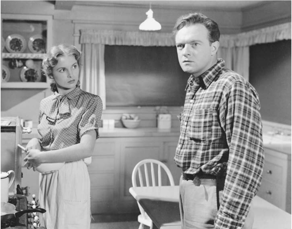
Act of Violence (1948). Directed by Fred Zinnemann. Shown from left: Janet Leigh (as Edith Enley), Van Heflin (as Frank Enley).

the mental and physical scars of war, Joe is ready to take Frank's life as vengeance. Only his noble girlfriend, Ann, newly arrived from New York, tries to dissuade him from this course using her compensating moral values of forgiveness and mercy.