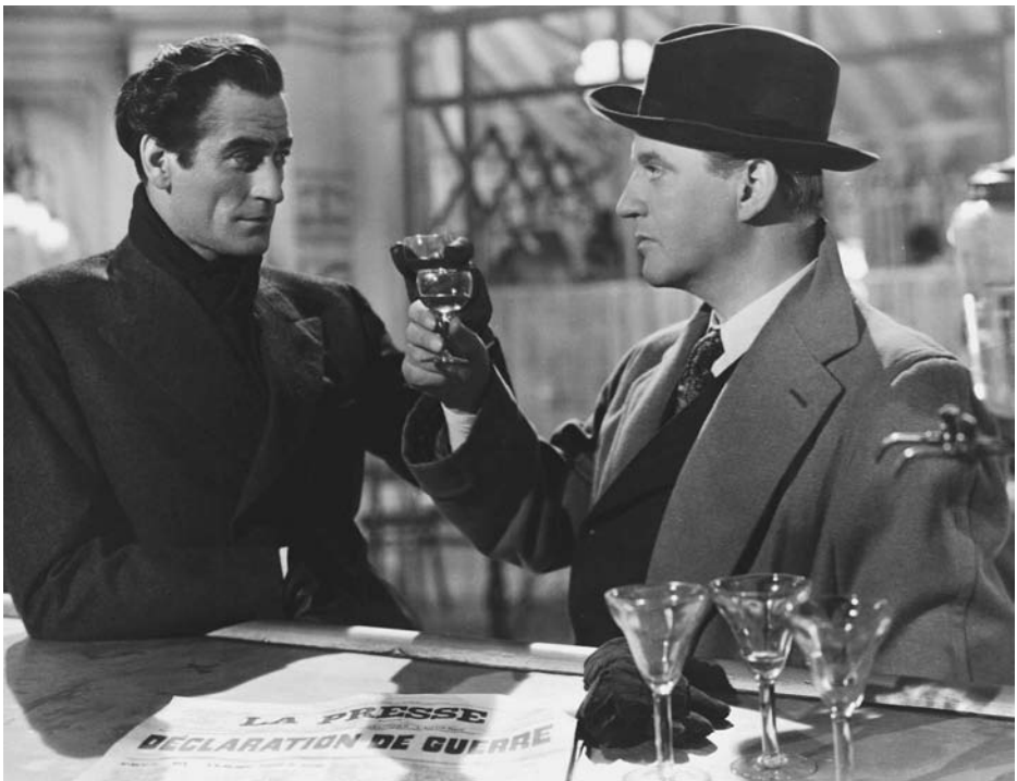
The Spider and the Fly (1949, British). Directed by Robert Hamer. Shown from left: Guy Rolfe (as Philippe de Ledocq), Eric Portman (Ferdinand Maubert).

Robert Hamer left Ealing Studios soon after the completion of Kind Hearts and Coronets and made The Spider and the Fly for an independent company. Both films were criticized, unfairly, as cold and remote. The basis for this reaction came from their less than optimistic presentation of human nature and morally problematic characters. Intelligence, not the law, becomes the prime determinant of human worth in The Spider and the Fly , which focuses on the powerful bond between three