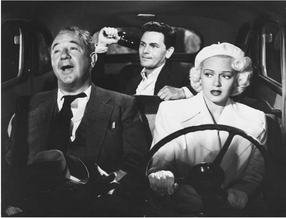
The Postman Always Rings Twice (1946). Directed by Tay Garnett. Shown from left: Cecil Kellaway (as Nick Smith), John Garfield (as Frank Chambers), Lana Turner (as Cora Smith).

from the original novel for any single feature film to bear. Some scenes therefore feel sketchy, but overall, it remains a powerful melodramatic work, and John Garfield and Lana Turner make a charismatic team as the two lead characters.