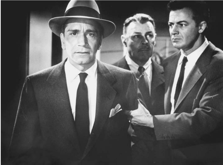
The Big Combo (1955). Directed by Joseph H. Lewis. Shown: Richard Conte (as Mr. Brown), Brian Donlevy (as Joe McClure), Cornel Wilde (as Lieutenant Leonard Diamond).

replaced by a neurotic battle between police lieutenant Leonard Diamond and his alter ego, the gangster Mr. Brown. The overt theme of the film is expressed by Brown when he tells a hapless boxer that “number one is somebody and number two is nobody.”