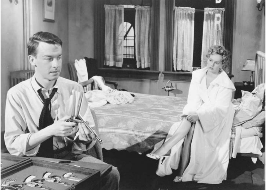
Gun Crazy (1950, also called Deadly is the Female). Directed by Joseph H. Lewis. Shown: John Dall (as Bart Tare), Peggy Cummins (as Annie Laurie Starr).

own lifelong fascination with guns. However, unlike Starr, he cannot kill. This emanates from an incident when as a young boy, he killed a baby chick with his BB gun. After a period in reform school and the army, Bart returns to his hometown and visits a traveling circus, where he accepts a challenge from sharpshooter Annie Laurie Starr to compete on stage in a shooting contest. This sequence, replete with Lewis's customary skill involving dramatic compositions and expert editing, is a textbook example of how skilled filmmakers could bypass censorship prohibitions imposed by the Production Code Authority. Instead of a literal depiction of lust, Lewis exploits the obvious phallic sensuality of the gun and, via a series of clever inserts and low-level compositions, immediately establishes the sexual attraction between this sharp, knowing woman and passive, alienated male, who are bonded together through their fascination with the power and danger of the handgun.