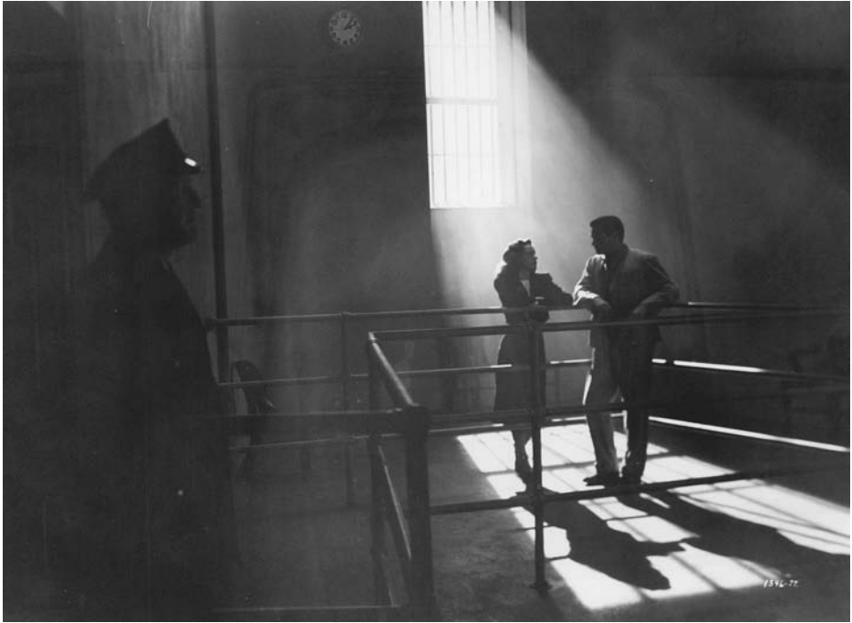
Phantom Lady (1944). Directed by Robert Siodmak. Shown in silhouette in background: Ella Raines (as Carol “Kansas” Richman), Alan Curtis (as Scott Henderson).