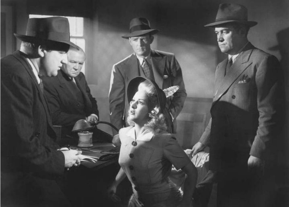
I Wake Up Screaming (1941). Directed by H. Bruce Humberstone. Shown in foreground: Laird Cregar (as Ed Cornell), Betty Grable (as Jill Lynn).

who are all attracted to Vickie (and who all feel used by the ambitious young model), and Harry, the surly switchboard boy at her apartment building. Jill also says she had noticed someone suspicious stalking Vickie at the restaurant where she worked, ogling her like the “wolf at the three little pigs.” It transpires that this obsessed figure is police detective Cornell, who is himself now investigating Vickie’s death.