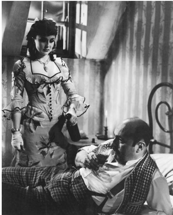
Pink String and Sealing Wax (1946, British). Directed by Robert Hamer. Shown from left: Googie Withers (as Pearl Bond), Garry Marsh (as Joe Bond).

Patriarchal punishment of the fallen woman is a central motif in the film. Sutton's stern discipline of his family prohibits son David's courtship of a young woman and daughter Victoria's desire to train as an opera singer. Both desires, Edward Sutton tells his children, are immoral. He explains to his long-suffering wife, Ellen, his philosophical rationale for controlling the family in such a manner: "Love and