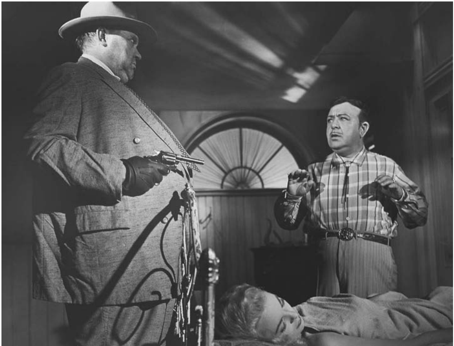
Touch of Evil (1958). Directed by Orson Welles. Shown from left: Orson Welles (as Police Captain Hank Quinlan), Janet Leigh (as Susan "Susie" Vargas), Akim Tamiroff (as "Uncle" Joe Grandi).

TOUCH OF EVIL (Universal International, 1958). Director: Orson Welles. Producer: Albert Zugsmith. Script: Orson Welles, from the novel Badge of Evil by Whit Masterson. Cinematography: Russell Metty. Music: Henry Mancini. Cast: Charlton Heston (Ramon "Mike" Vargas), Janet Leigh (Susan Vargas), Orson Welles (Hank Quinlan), Joseph Calleia (Pete Menzies), Akim Tamiroff (Uncle Joe Grandi), Marlene Dietrich (Tanya), Mercedes McCambridge (Hoodlum), Zsa Zsa Gabor (Owner of Nightclub), Ray Collins (Adair), Dennis Weaver (Motel Manager).