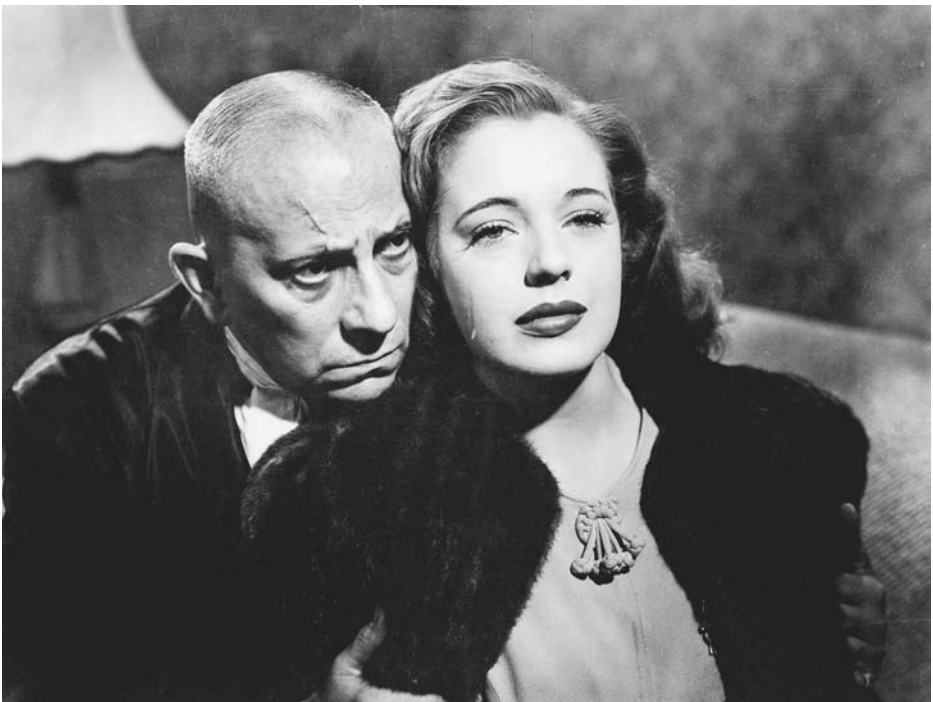
The Great Flamarion (1945). Directed by Anthony Mann. Shown from left: Erich von Stroheim (as The Great Flamarion), Mary Beth Hughes (as Connie Wallace).

While Mann brought his customary toughness, accompanied by the familiar noir devices such as flashback narration, a tormented protagonist, and a strong