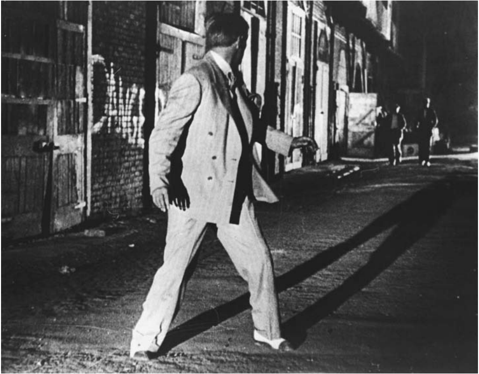
Night and the City (1950). Directed by Jules Dassin. Shown: Richard Widmark (as Harry Fabian).

This key noir film was filmed in London in 1949. Darryl F. Zanuck, the head of production at Twentieth Century Fox, sent director Jules Dassin to Britain as he was about to be expelled from the studio following orders from New York because of his left-wing political sympathies. Zanuck told Dassin to start filming Jo Eisinger's script for Night and the City as soon as he could, and he also told Dassin to film the most expensive scenes first so that it would be costly for the studio to remove him from the film. Zanuck also asked Dassin if he could develop a role for one of the studio's most important female stars, Gene Tierney, as he wanted to get her away from Hollywood following a failed romance.