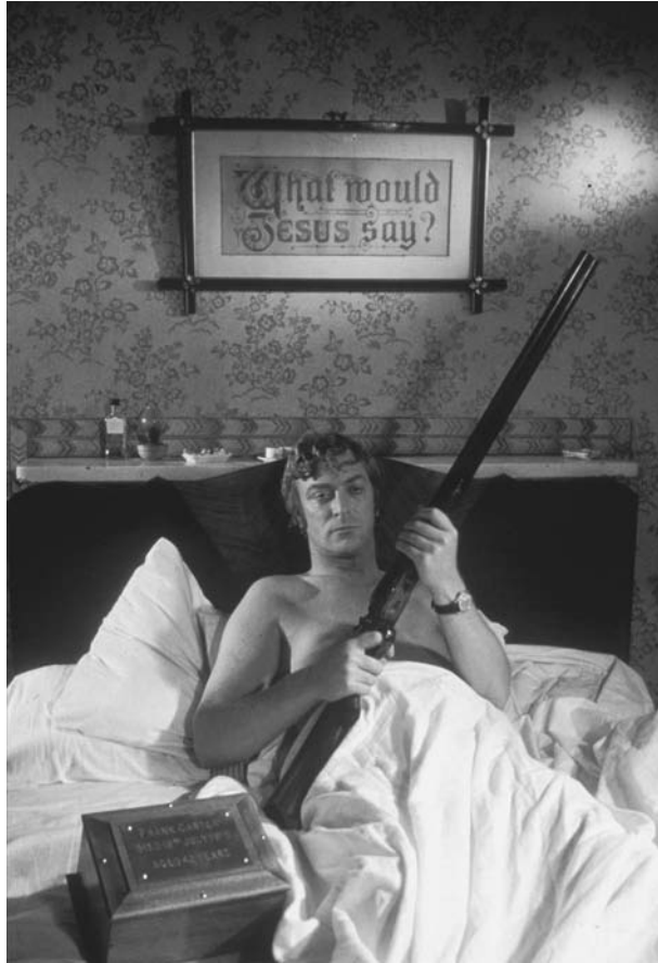
Get Carter (1971, British). Directed by Mike Hodges. Shown: Michael Caine (as Jack Carter).

Jack is caught between the corrupt Kinnear and members of his own gang who have been sent by Fletcher to bring him back to London. However, when Fletcher learns that Carter has been sleeping with his wife, Anna, he orders Carter's death.