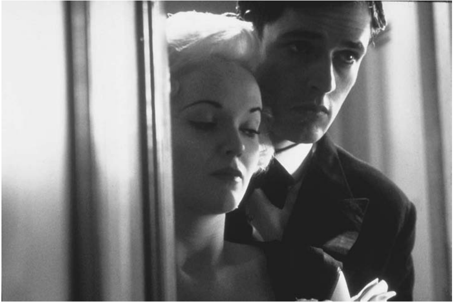
Dance with a Stranger (1985). Directed by Mike Newell. Shown: Miranda Richardson (as Ruth Ellis), Rupert Everett (as David Blakely).

long-suffering admirer, and Andy, her son. However, the only information we learn about Desmond and Andy is restricted to the destructive effect that Ellis and Blakely have on their lives.