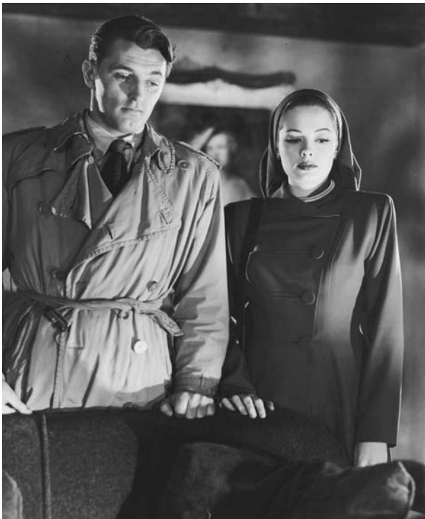
Out of the Past (1947). Directed by Jacques Tourneur. Shown: Robert Mitchum (as Jeff Bailey), Jane Greer (as Kathie Moffett).

Often described as the quintessential film noir, Jacques Tourneur's 1947 classic Out of the Past is certainly one of the finest, most accomplished, and most moving films in the genre, representing the combined talents of many individuals working at their peak with the support and encouragement of the RKO production team system. Tourneur was a master of atmosphere and tone, Nicholas Musuraca created a luminous black-and-white aesthetic both in his location and studio-bound cinematography, and the three leads (Robert Mitchum, Jane Greer, and Kirk Douglas) forge characterizations that have become the standard for particular genre types: the fated man, the duplicitous femme fatale, and the rich and ruthless criminal boss. In addition, Out of the Past examines what Alain Silver and Elizabeth Ward call, in their book Film Noir: An Encyclopedic Reference to the American