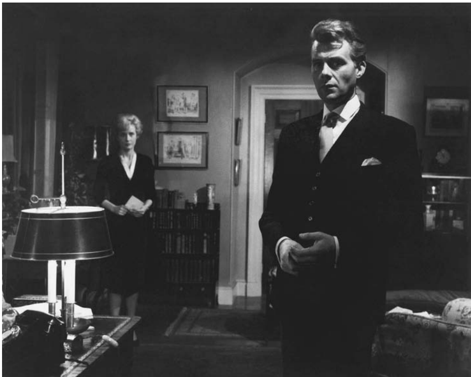
Victim (1961). Directed by Basil Dearden. Shown from left: Sylvia Syms (as Laura Farr), Dirk Bogarde (as Melville Farr).

Laura and Farr—if he had sex with Barrett, this would not have been available as a viable ending.