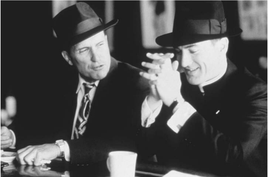
True Confessions (1981). Directed by Ulu Grosbard. Shown from left: Robert Duvall (as Tom Spellacy), Robert De Niro (as Des Spellacy).

(Tom Spellacy), Charles Durning (Jack Amsterdam), Ed Flanders (Dan Campion), Burgess Meredith (Seamus Fargo), Cyril Cusack (Cardinal Danaher), Kenneth McMillan (Frank Crotty), Rose Gregorio (Brenda Samuels).