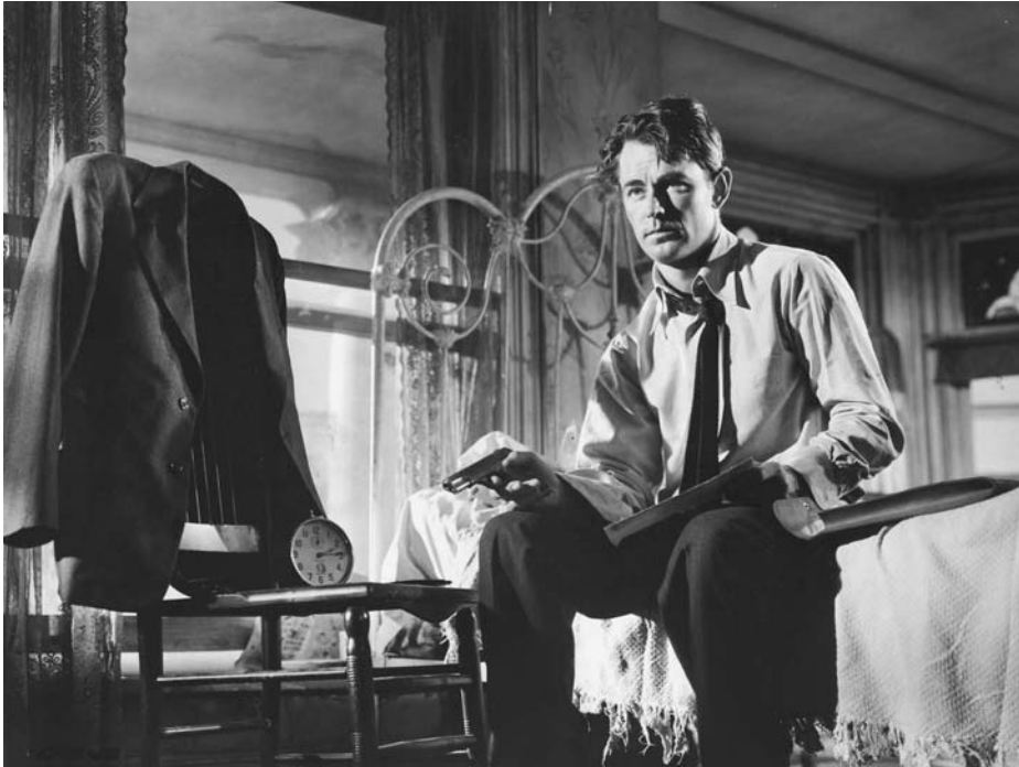
This Gun for Hire (1942). Directed by Frank Tuttle. Shown: Alan Ladd (as Phillip Raven).

Raven's revenge against Gates and Graham's desire to expose Gates as a spy come together in the film's final act when Raven sacrifices his life for Graham by exposing Gates as a spy. The final moments weaken the film's noir attributes as it becomes an overt propaganda vehicle designed to warn Americans about the actions of fifth columnists undermining the war effort. Just as Warner Bros. exploited Humphrey Bogart's gangster image in the similarly themed film All through the Night (1942), Paramount reworked Graham Greene's novel to show that even amoral killers, such as Phillip Raven, would sacrifice themselves if they could help save their country from foreign elements.