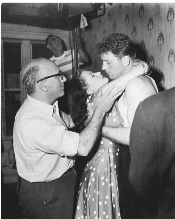
Criss Cross (1949). Directed by Robert Siodmak. Shown from left during production: Robert Siodmak, Yvonne De Carlo (as Anna), Burt Lancaster (as Steve Thompson).