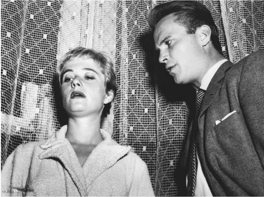
Kiss Me Deadly (1955). Directed by Robert Aldrich. Shown from left: Gaby Rodgers (as Gabrielle/Lily Carver), Ralph Meeker (as Mike Hammer).

and violence when they direct both kisses and gunfire in Mike's direction. But in the culmination of the story, the plot moves beyond the usual types of crime into a modern nightmare world of atomic energy and an illegal trade in nuclear fuel. The ominous names "Manhattan Project, Los Alamos, Trinity" presage the almost apocalyptic climax to Hammer's search for the truth.