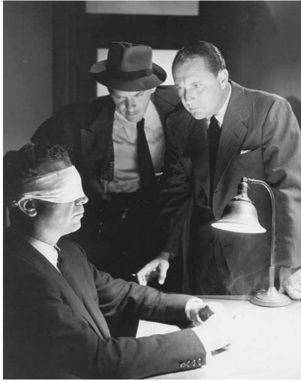
Murder My Sweet (1944). Directed by Edward Dmytryk. Shown from left: Dick Powell (blindfolded as Philip Marlowe), Don Douglas (far right as Lieutenant Randall).

pieces together and emerge relatively unscathed. From time to time he is forced to reexamine his own code of conduct by which he tries to function, despite the mix of danger and temptation he confronts. The chronological unfolding of the quest is contained (in flashback form) within a frame where a blindfolded Marlowe is being interrogated by police detectives, and thus the audience is kept intrigued by never knowing more than the hero at any stage.