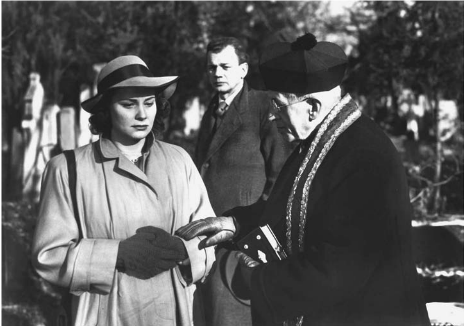
The Third Man (1949). Directed by: Carol Reed. Shown at left: Alida Valli (as Anna Schmidt). Center background: Joseph Cotten (as Holly Martins).

Graham Greene never intended The Third Man to be a serious film, yet it remains one of the great films. There are numerous highlights, including the memorable first shot of Orson Welles, as Harry Lime, exposed in a doorway by an overhead light, together with the famous climax in the sewers beneath Vienna. But the film is also notable in its clever reworking of familiar narrative conventions to form a coherent, fatalistic mosaic that captures the despair, pain, and corruption of