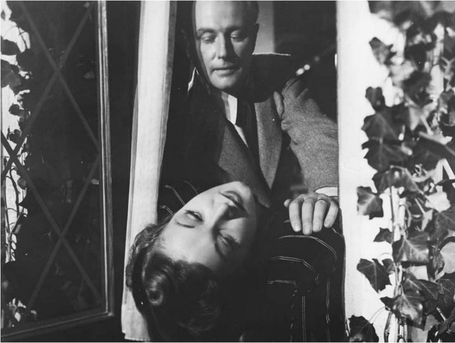
My Name Is Julia Ross (1945). Directed by Joseph H. Lewis. Shown: George Macready (as Ralph Hughes), Nina Foch (as Julia Ross).

from Columbia. The result was that My Name Is Julia Ross was a financial and critical success and gave Lewis the career breakthrough he had been seeking after more than a decade working on low-budget films.