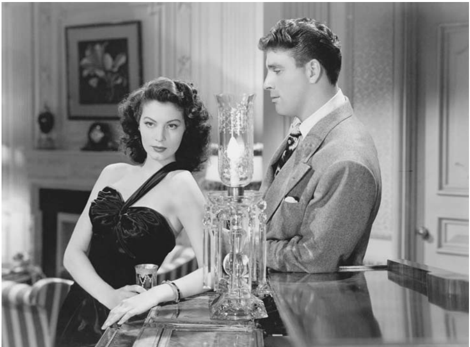
The Killers (1946). Directed by Robert Siodmak. Shown from left: Ava Gardner (as Kitty Collins), Burt Lancaster (as "the Swede").

Despite its rather unusual narrative structure and its lack of a strong link between its main continuing character and its chain of story events, The Killers is still considered to be one of the more stylish and accomplished noir films of the mid-1940s. It is essentially an expansion of the famous Ernest Hemingway story of the same name into a long investigation that is assembled using a narrative structure based on the model of Citizen Kane . The content of Hemingway's story acts like a prologue to The Killers's central events, but his hard-boiled dialogue and laconic style