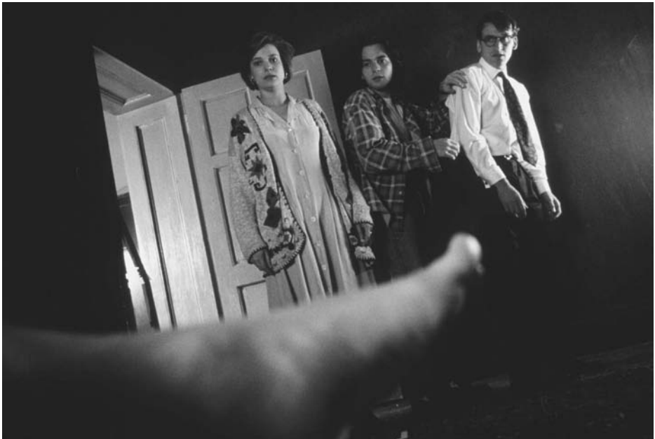
Shallow Grave (1994). Directed by Danny Boyle. Shown: Kerry Fox (as Juliet Miller), Ewan McGregor (as Alex Law), Christopher Eccleston (as David Stephens).

Shallow Grave was celebrated by British critics for its effective use of local (Edinburgh and Glasgow) settings. It was presented as a successor to the dark strain of British comedy that seeped through the conventional surface of the British cinema in the late 1940s and 1950s in films such as Ealing's Kind Hearts and Coronets (1949) and The Ladykillers (1955). Yet the story line and characterizations of this film, unlike the Ealing films, are more universal and could be found in any city,