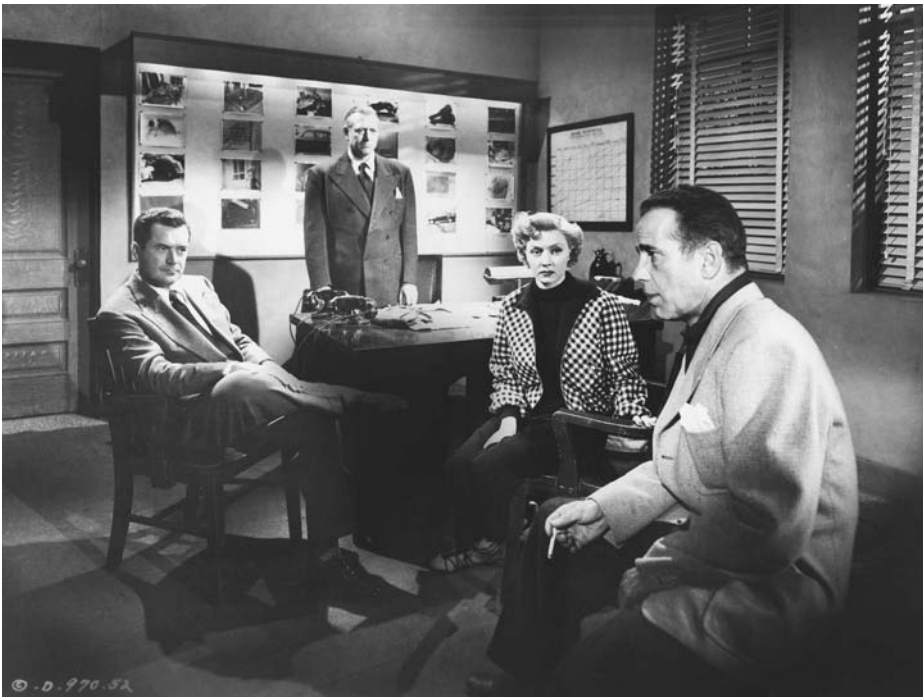
In a Lonely Place (1950). Directed by Nicholas Ray. Shown from left: Frank Lovejoy (as Det. Sgt. Brub Nicolai), Carl Benton Reid (as Capt. Lochner), Gloria Grahame (as Laurel Gray), Humphrey Bogart (as Dixon Steele).

“I was born when she kissed me; I died when she left me; I lived a few short weeks while she loved me.” These are the most famous and poignant lines from In a Lonely Place , an intriguing noir collaboration between director Nicholas Ray and star Humphrey Bogart. Made by Bogart’s independent company, Santana Pictures, and set in the world of Hollywood filmmaking, it is a somber, broodingly romantic,