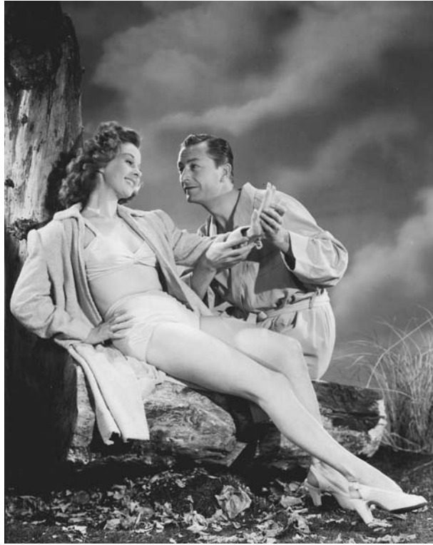
They Won't Believe Me (1947). Directed by Irving Pichel. Shown: Susan Hayward (as Verna Carlson), Robert Young (as Larry Ballentine).

However, just before the verdict is read out to the court, Ballentine is shot dead while trying to climb out of the courtroom window in a failed suicide attempt. This ironic twist reiterates one of noir's enduring themes concerning moral guilt, which almost always overrides any criminal transgression.