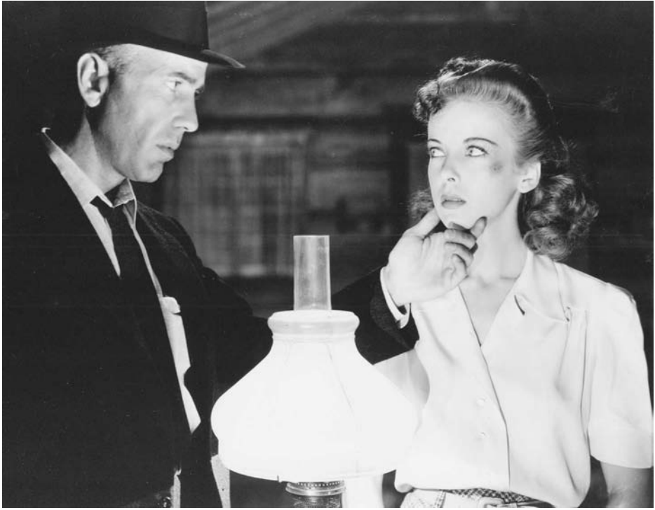
High Sierra (1941). Directed by Raoul Walsh. Shown: Humphrey Bogart (as Roy Earle), Ida Lupino (as Marie Garson).

Velma, after allowing Roy to pay for her operation, rejects him as being too old for her. Roy's pain is compounded by the fact that the robbery goes wrong and Red and Babe are killed while Roy and Marie flee, trying to elude the police. Trapped in the Sierra Mountains, Roy dies when a sniper shoots him. The film concludes with Marie's realization that death is the best result for Roy as he is finally released from a society that offers him nothing but pain and disillusionment.