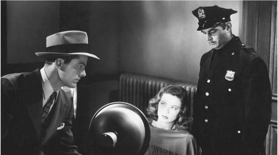
Laura (1944). Directed by Otto Preminger. Shown: Dana Andrews (as Mark McPherson), Gene Tierney (as Laura Hunt).

the film, there occurs a flashback of much the same length, in which Waldo tells Mark of his first inauspicious meeting with Laura and then of helping Laura's career and coming to admire her. As McFarlane tries to interview other acquaintances of Laura, all the main suspects tail along with him as he does his rounds. The most dramatic, startling, and famous aspect of the film's narrative, though, is the shock plot twist halfway through, when Laura turns up alive and an utterly astounded Mark has to identify the real victim. Laura and Mark become romantically entangled. Waldo is eventually revealed as the killer, trying to eliminate Laura because he did not want to lose her in marriage to the charming wastrel Shelby Carpenter. A model called Diane Redfern is killed in Laura's apartment doorway when Waldo mistakes her for Laura because she has a similar build and is wearing Laura's negligee. He fires both barrels of buckshot into her face.