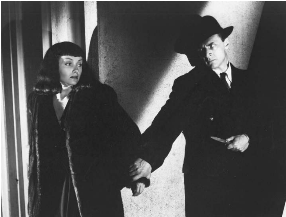
The Seventh Victim (1943). Directed by Mark Robson. Shown: Jean Brooks (as Jacqueline Gibson), and Feodor Chaliapin Jr. (as Leo).

The Seventh Victim was one of Lewton's best films, and it has not, until recently, received its due recognition by critics and scholars. While it was not as visually accomplished as Lewton's first two films, Cat People and I Walked with a Zombie ,