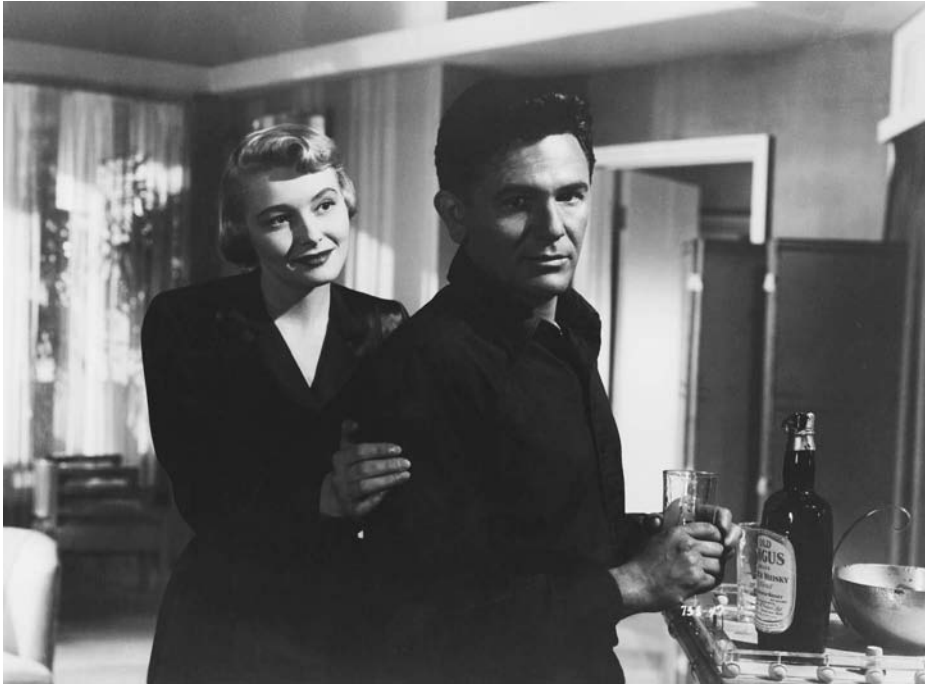
The Breaking Point (1950). Directed by Michael Curtiz. Shown from left: Patricia Neal (as Leona Charles), John Garfield (as Harry Morgan).

The Breaking Point , which was also directed by Curtiz, proves a nice symmetry to Garfield's career, although his final years, when he was hounded by anti-Communist zealots in America, and specifically by the HUAC, contributed to his death at the age of 40 and were an indictment of the hysteria that controlled much of America at that time. This climate also meant that the film failed at the box office in the United States as Warner Bros. had no faith in it and spent little money on advertising; this wonderful film has remained virtually unnoticed since its release.