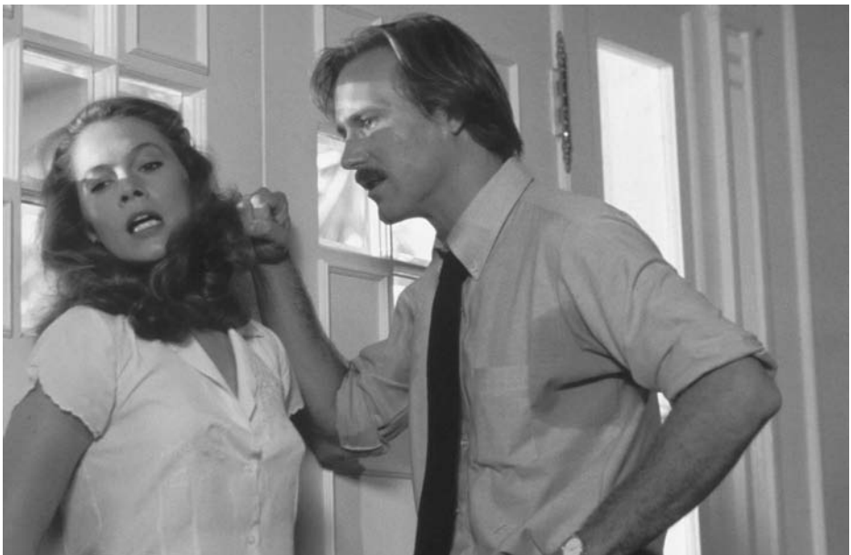
Body Heat (1981). Directed by Lawrence Kasden. Shown from left: Kathleen Turner (as Matty Walker), William Hurt (as Ned Racine).

BODY HEAT (Warner Bros./The Ladd Company, 1981). Director: Lawrence Kasdan. Producer: Fred T. Gallo. Script: Lawrence Kasdan. Cinematography: Richard H. Kline. Music: John Barry. Cast: William Hurt (Ned Racine), Kathleen Turner (Matty Walker), Richard Crenna (Edmund Walker), J. A. Preston (Oscar Grace), Ted Danson (Peter Lowenstein), Mickey Rourke (Teddy Lewis).