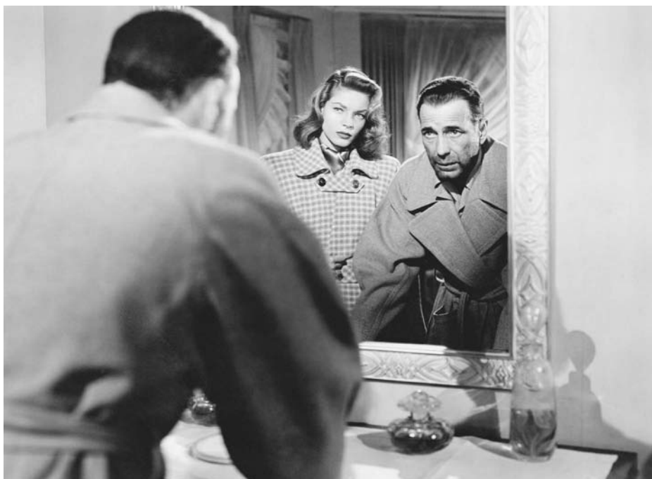
Dark Passage (1947). Directed by Delmer Daves. Shown from left: Lauren Bacall (as Irene Jansen), Humphrey Bogart (as Vincent Parry).

The first two films Humphrey Bogart and Lauren Bacall made together, To Have and Have Not (1944) and The Big Sleep (1946), were immensely popular as audiences welcomed their wisecracking dialogue and sensual sparring. Dark Passage , however, was less commercially successful. It was decidedly darker in tone and imbued with a strong melancholic streak. This was primarily due to its source novel by David Goodis, one of the more bizarre hard-boiled writers who worked in Hollywood in the 1940s. While the film softened the novel's presentation of