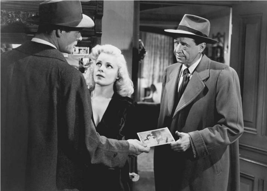
On Dangerous Ground (1952). Directed by Nicholas Ray. Shown from left: Robert Ryan (as Jim Wilson), Cleo Moore (as Myrna Bowers), Anthony Ross (as Pete Santos).

believe, will be able to help them solve the murder. Wilson sends Santos away and “interrogates” Myrna alone, and the film’s depiction of sadomasochism is startling for a studio film in the early 1950s. Wilson’s eagerness to exploit Myrna’s masochistic tendencies with his own sadism and anger, which, the film suggests, emanate from his disgust with the promiscuous behavior of young women, is very raw.