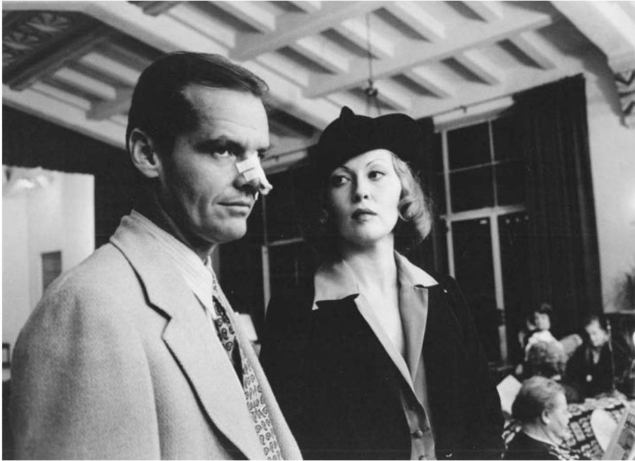
Chinatown (1974). Directed by Roman Polanski. Shown: Jack Nicholson (as Jake “J.J.” Gittes), Faye Dunaway (as Evelyn Mulwray).

comment on the public and political corruption of the early 1970s in the United States and was seen as part of the emerging interest in the revival of the film noir spirit and of the private eye genre in those years of malaise. Since the film’s story line involves events of the late 1930s, it might best be labeled as retro noir, that subgroup of neo-noir where the narrative settings are of the 1930s, 1940s, or 1950s, but the frankness and explicitness of theme are very much of the post-Production Code era. Furthermore, director Roman Polanski and script writer Robert Towne introduce fresh variations into the old form. With the passage of more than 30 years since its release, it is possible now to view Chinatown as transcending the limits of story type and indeed as being one of the most accomplished films of the late twentieth century of any genre.