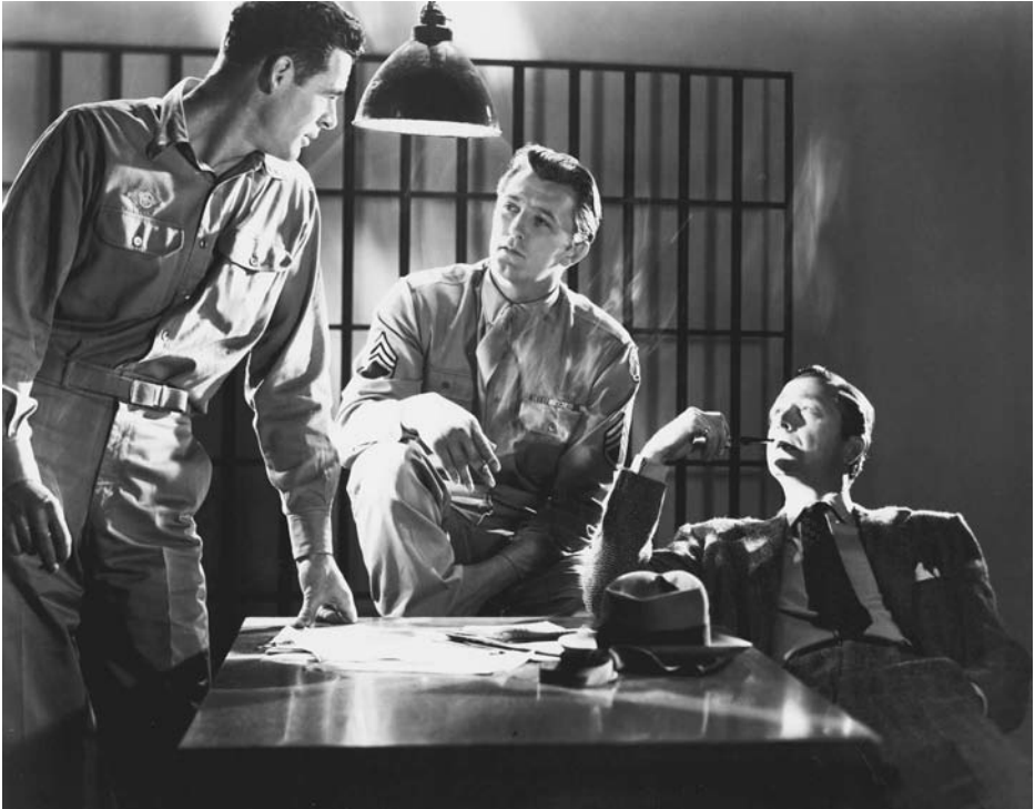
Crossfire (1947). Directed by Edward Dmytryk. Shown from left: Robert Ryan (as Montgomery), Robert Mitchum (as Keeley), Robert Young (as Finlay).

as a murderer (from 50 mm down to 25 mm) to produce a compellingly distorting effect.