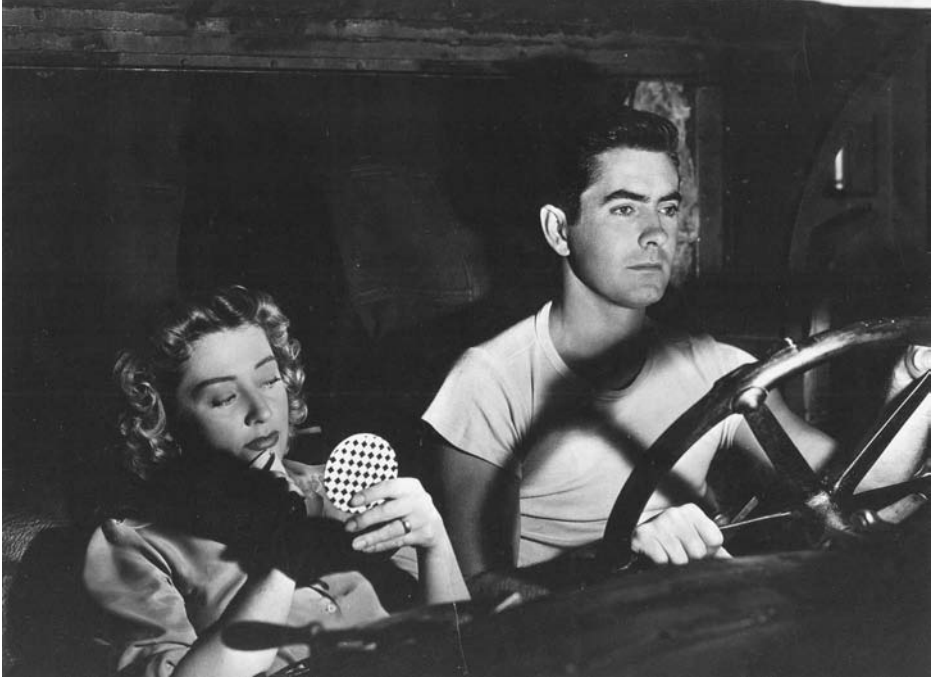
Nightmare Alley (1947). Directed by Edmund Goulding. Shown: Joan Blondell (as Zeena Krumbein), Tyrone Power (as Stanton "Stan" Carlisle).

to fleece a wealthy businessman when he forms an alliance with a ruthless psychiatrist, Dr. Lilith Ritter.