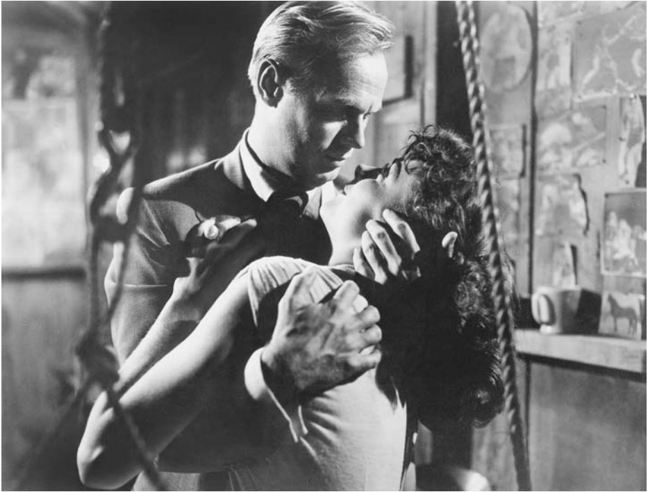
Pickup On South Street (1953). Directed and written by Samuel Fuller. Shown from left: Richard Widmark (as Skip McCoy), Jean Peters (as Candy).

be characterized as having a conservative or reactionary ideology. Most striking of all perhaps is the film's Dickensian panorama of people and places (despite all the supposed New York street scenes being shot in Los Angeles). Its three central characters are a cocksure pickpocket named Skip (Richard Widmark), a beaten-down but feisty police informer named Mo (Thelma Ritter), and a none-too-bright whore with a heart of gold called Candy (Jean Peters). They live in a low-rent riverside district of Manhattan in cramped tenements, cold-water apartments, or shacks that stand on poles above the waves of the Hudson. It is a vividly evoked milieu that could practically have sprung from the pages of Dickens's Our Mutual Friend .