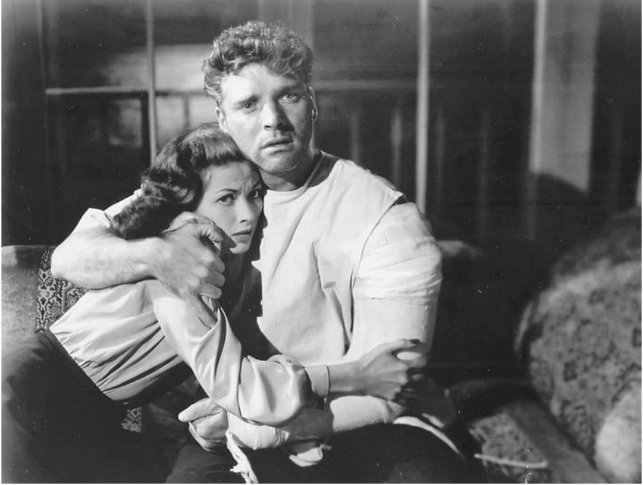
Criss Cross (1949). Directed by Robert Siodmak. Shown: Yvonne De Carlo (as Anna), Burt Lancaster (as Steve Thompson).