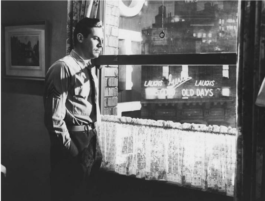
Somewhere in the Night (1946). Directed by Joseph L. Mankiewicz. Shown: John Hodiak (as George W. Taylor).

involves his search for hard evidence, actively seeking to solve the mystery of who he could be. Intrigue (which is inherent in amnesia stories) prevails: for much of the film, we and he do not know what is going on. He has, in effect, to become a detective and, appropriately, it turns out that he was once a private eye.