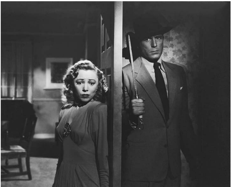
Born to Kill (1947). Directed by Robert Wise. Shown: Isabel Jewell (as Laury Palmer), Lawrence Tierney (as Sam Wild).